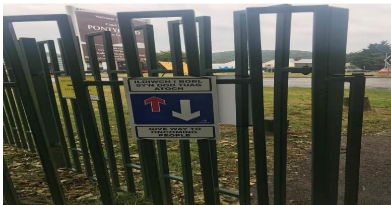
Also under consideration: