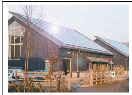
Units 4 and 5

Dulas is based in Unit 1 at Dyfi Eco Park in Machynlleth. This building is one of the most energy efficient office and factory units in Britain. Dyfi Eco Park itself is a small, rural, light industry park developed by the Welsh Development Agency on a reclaimed site. Buildings on the park are based around the principles of green/sustainable design and low-energy construction. The units have been built from locally-sourced materials with high energy efficiency. The award winning development represents an exemplar in energy and environmental performance.