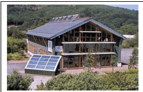
Unit 1, Dulas offices