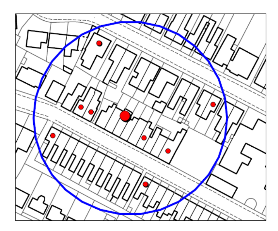
Figure 3 above shows an application site for an HMO, again with 50 dwellings within the 50 metres radius buffer of it. In this instance, there are 8 HMOs within the radius area, or 16% of the properties. Accordingly, an application with this scenario would be acceptable in Treforest in principle, although not acceptable elsewhere in Rhondda Cynon Taf.

Figure 3 - Example of suitable HMO application in the 20% Threshold Area, but unsuitable in 10% Threshold Area;