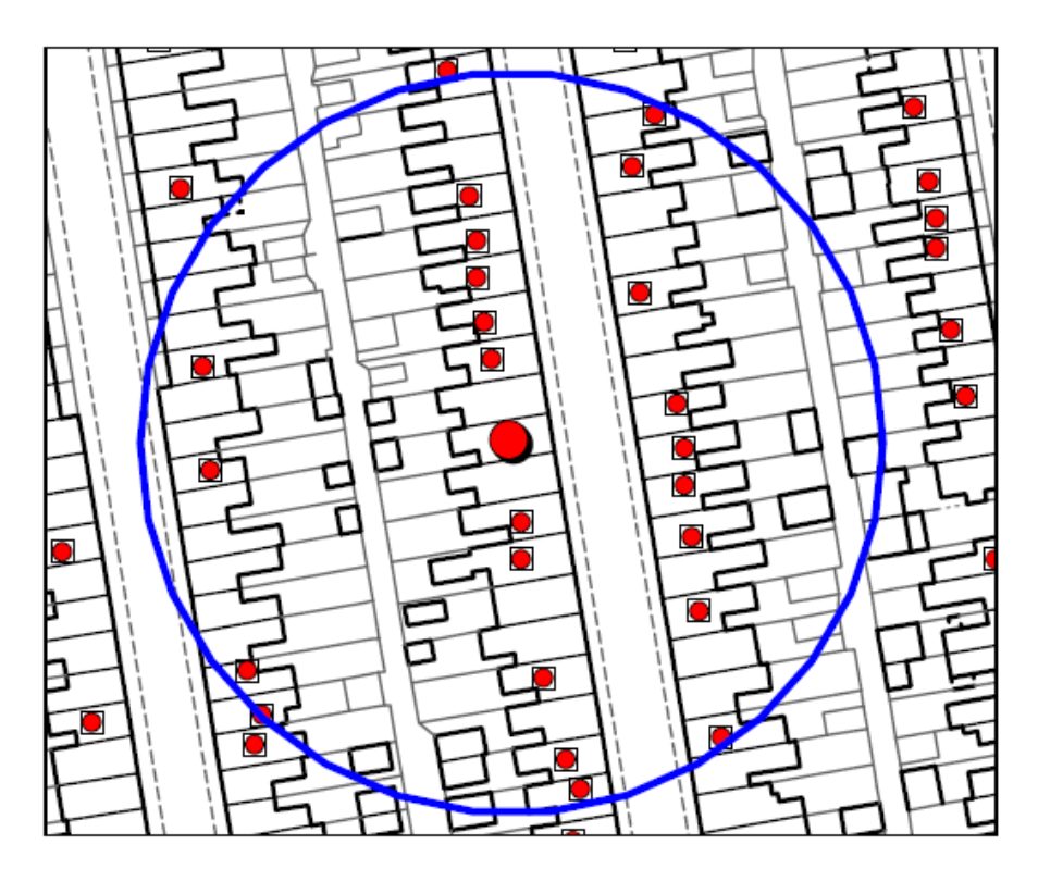
Figure 2 – 20% Threshold Area in Treforest

Figure 1 – Example of unsuitable HMO application in 20% Threshold Area;