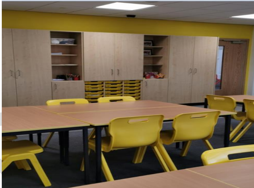
Typical junior classroom in a 21 st Century School delivered by the Council.

The school will be built in accordance with Building Bulletin 99 which requires new primary schools to include provision for team sports, including a playing field area suitable for team games for pupils aged 8 and over and a Multi-Use Games Area (MUGA) for sports such as basketball and netball. New schools are also required to include soft play areas, commonly made up of grassed space for pupils to sit and socialise, alongside hard surfaced playgrounds and sheltered space to complement the soft play areas around the school site. The new school will also include a habitat area which will act as a space for outdoor learning and provide a valuable teaching and learning resource.