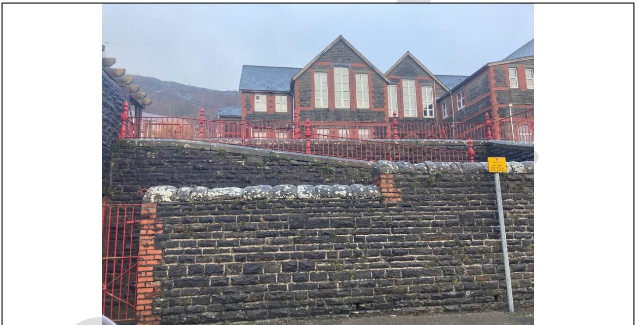
The view of the existing school building from Darran Terrace.

YGG Llyn y Forwyn is a Welsh medium community school located at Darran Terrace, Ferndale. The school site consists of a traditional stone Victorian School building. According to the condition survey of the school carried out by the Council in 2019, YGG Llyn y Forwyn is graded D for condition and C for suitability, where A is the highest and D is the lowest performing building respectively. It is acknowledged that this is the worst school in the Council's education portfolio in terms of condition and suitability.