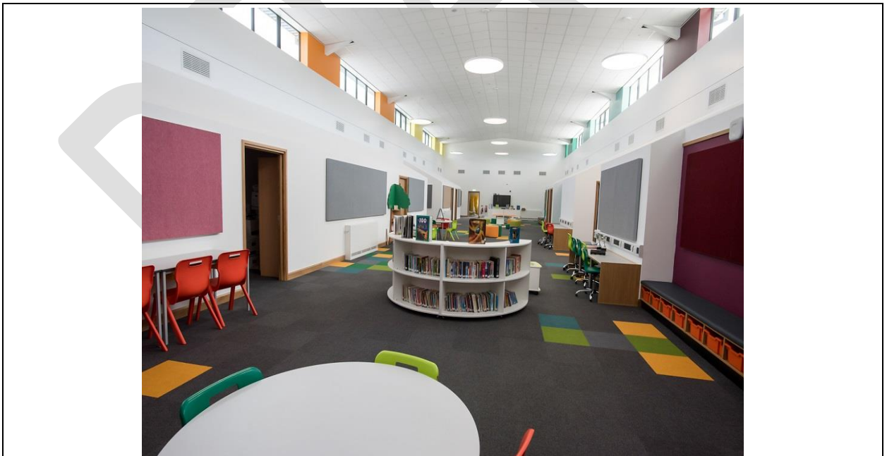
A multi-purpose learning resource area or 'heart space' at a 21 st Century School delivered by the Council.