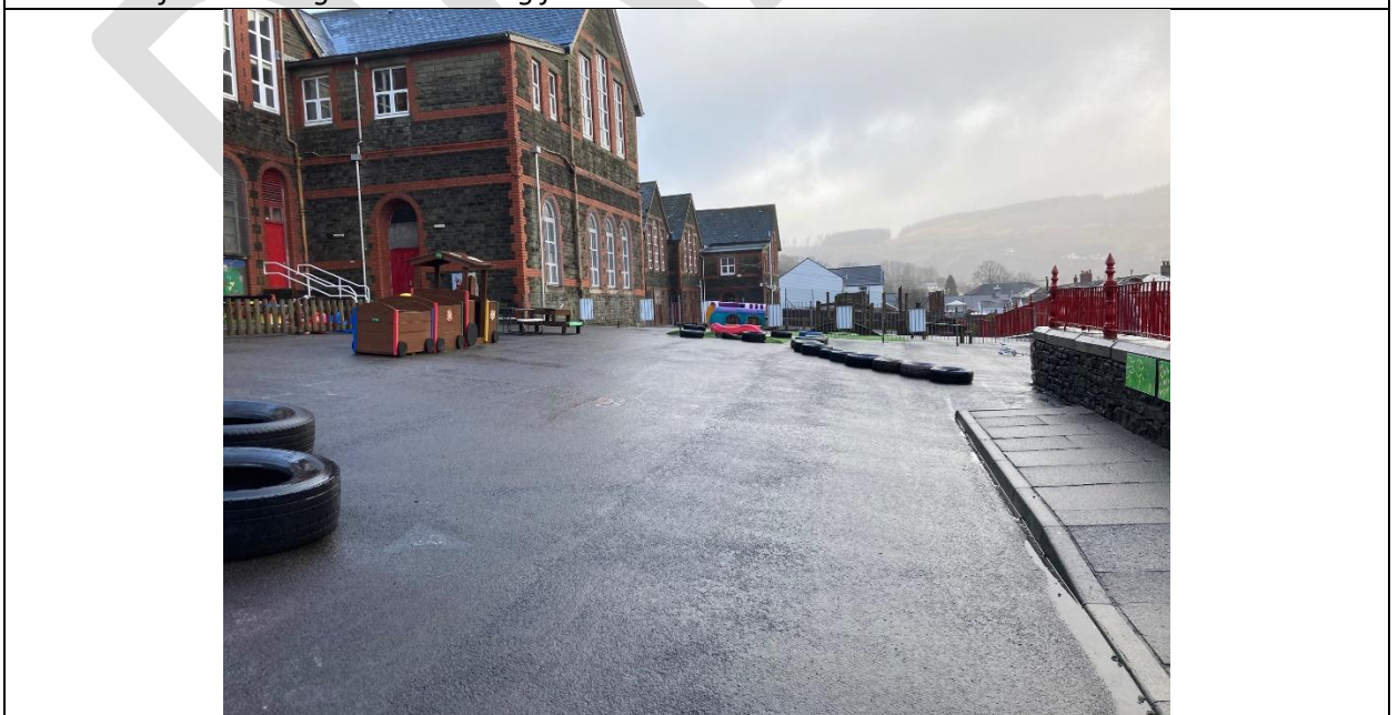
The view of the tarmac yard servicing the infant block.