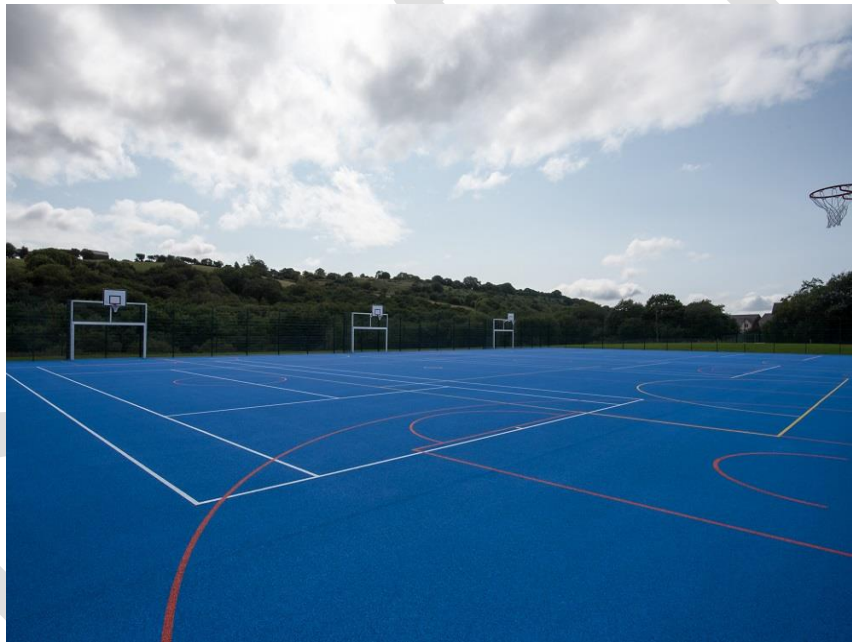
Example of MUGA servicing Tonyrefail Community School.