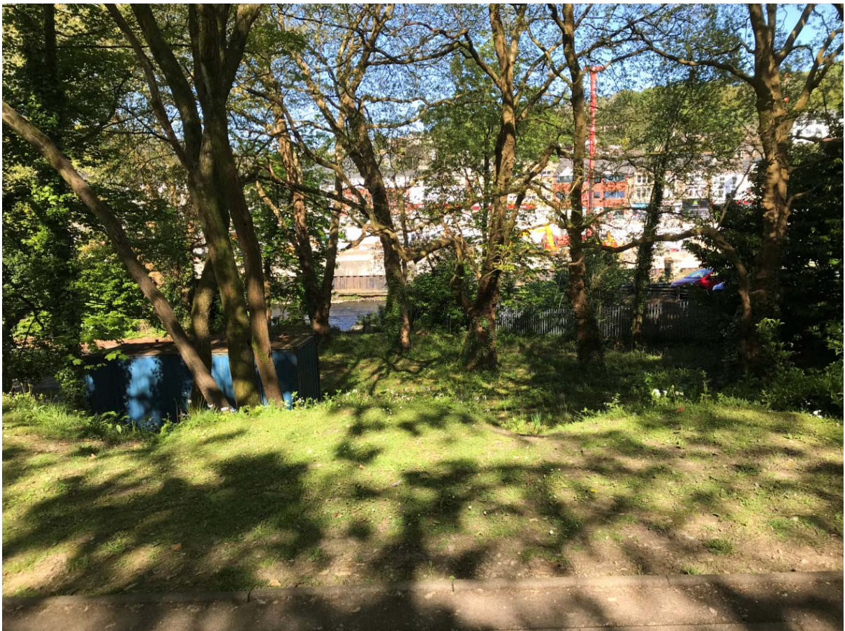
Riverside tree belt at the location of bridge crossing