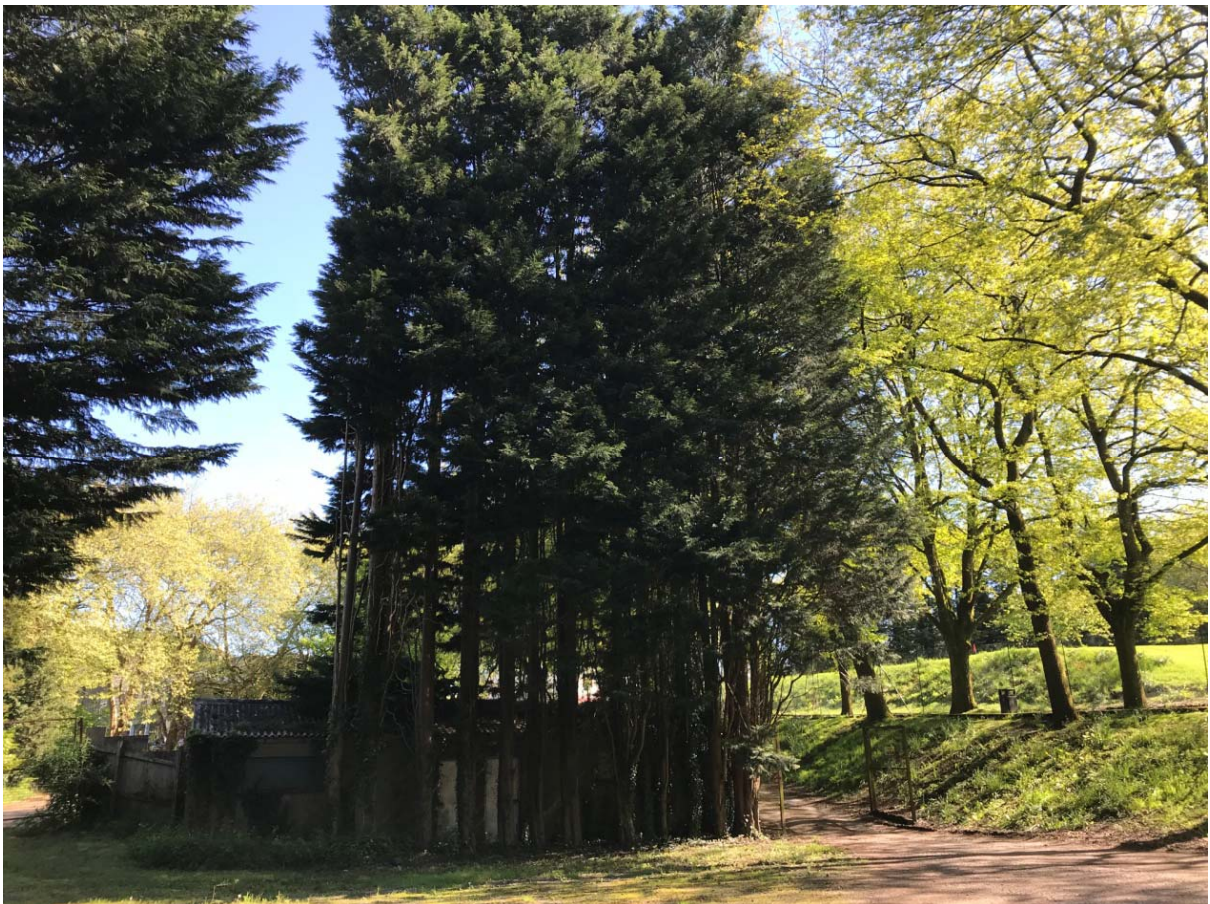
Outgrown hedge adjacent to redundant building