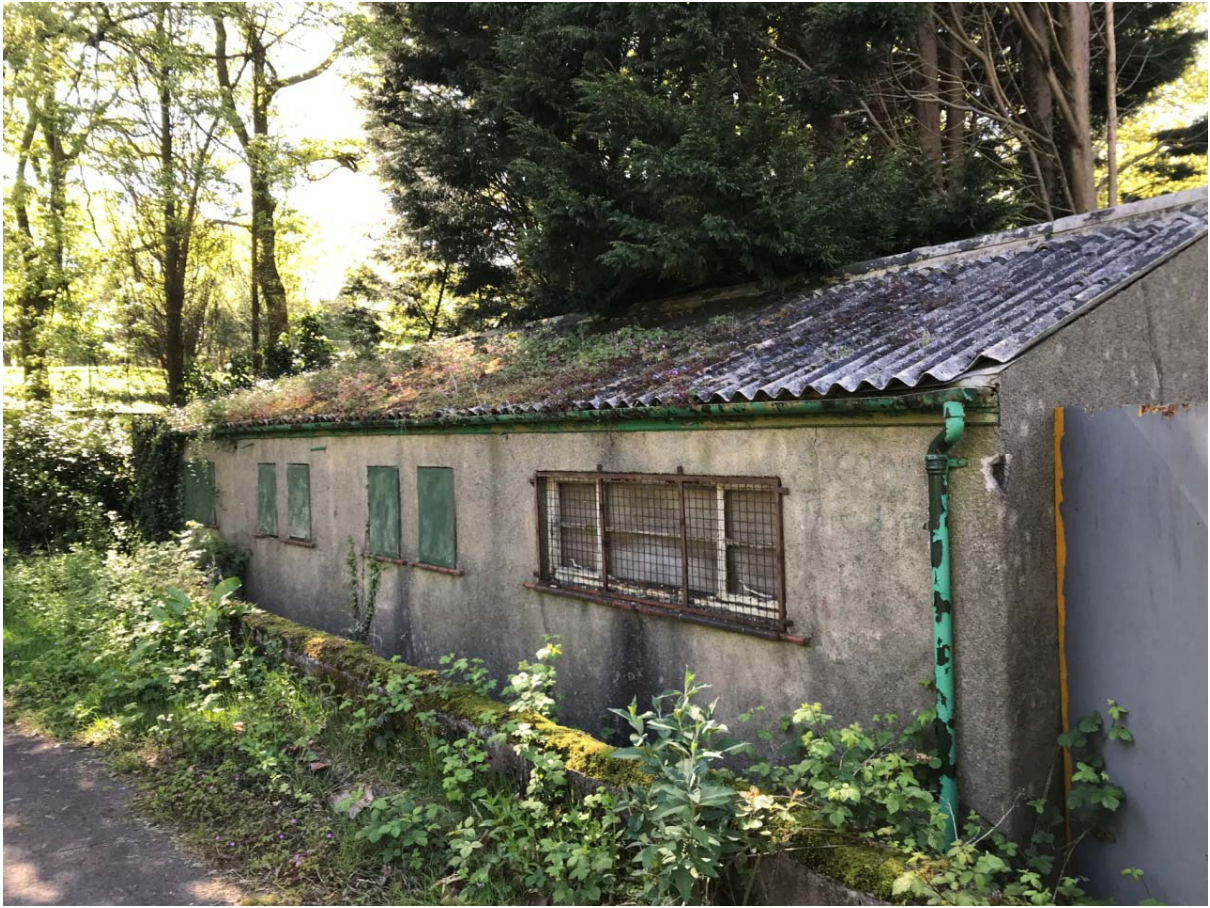
Remaining redundant building