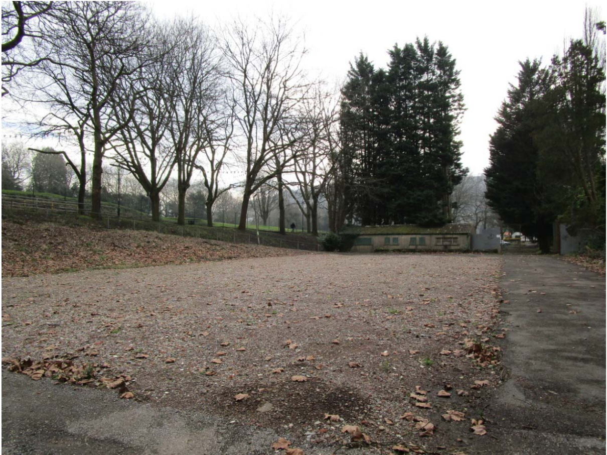
Former Day Care Centre Location of Bridge