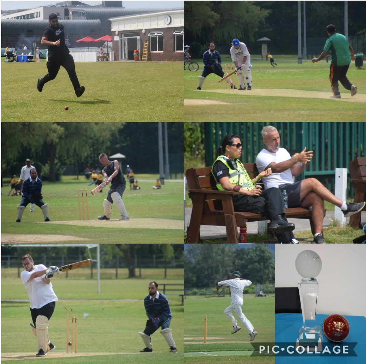
Images of the cricket match between members of Aberdare Mosque and South Wales Police.