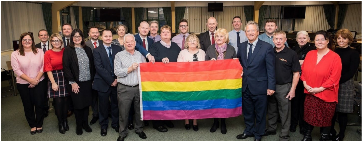
Cabinet members, members of the Senior Leadership Team, Trade Union Officers and Council staff raising the Rainbow flag.

For important dates and events in the LGBTQ+ calendar we continue to raise and fly the Rainbow and trans flags at our Head offices. This sends a positive message of inclusion to our staff and the wider community.