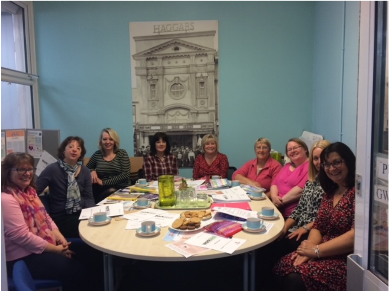
Library staff at their first menopause network meeting.