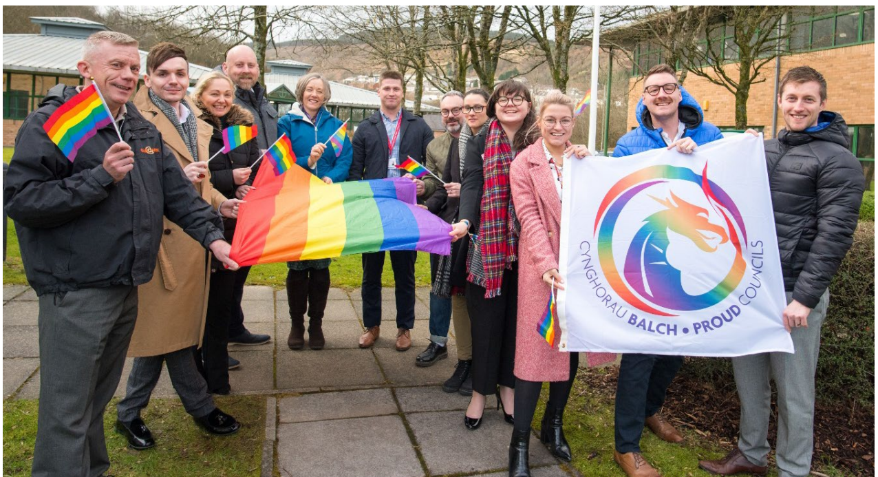
Council Staff Network members raising the Rainbow flag.