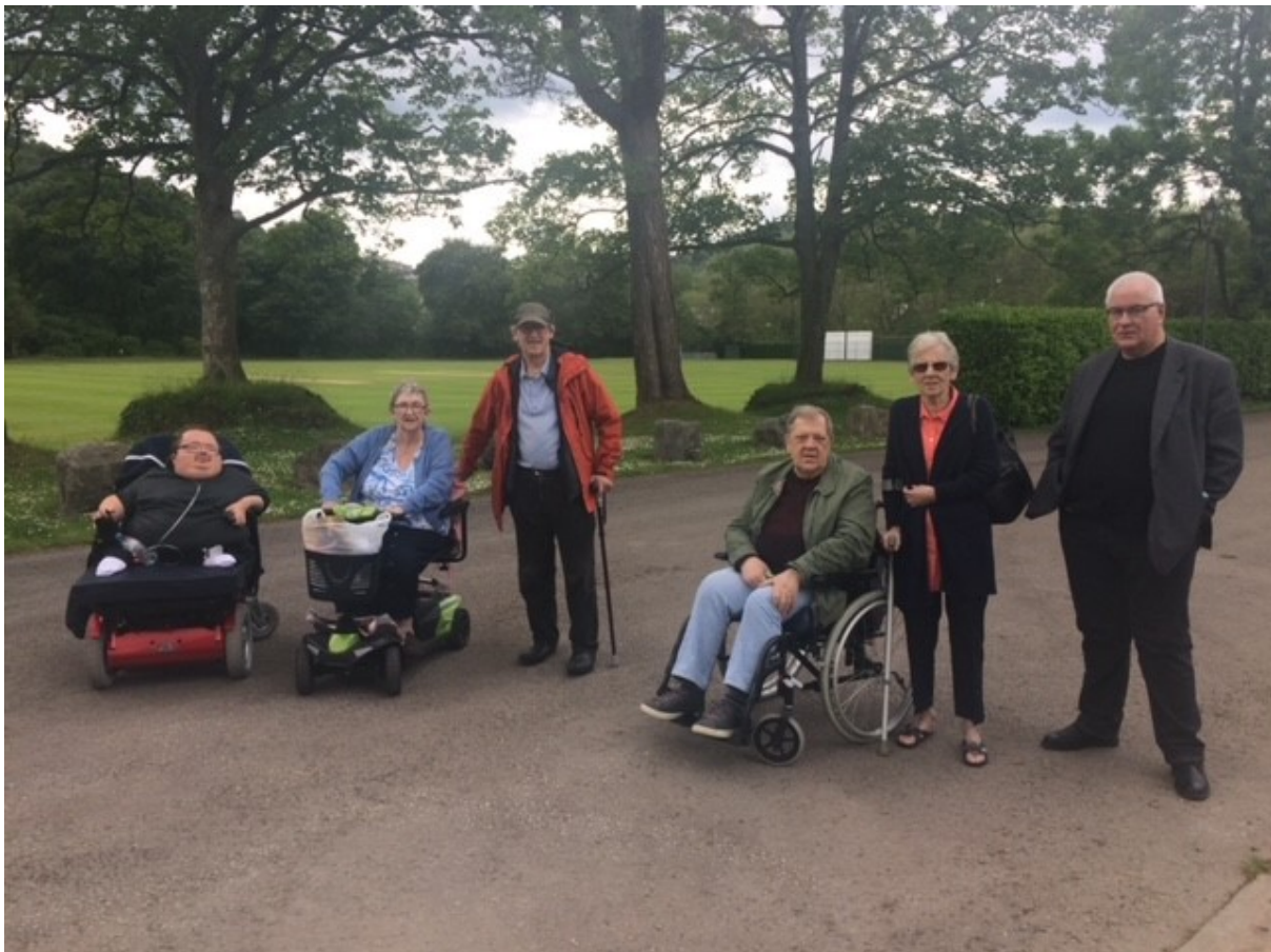
Members of the Disability Forum at Ynysangharad War Memorial Park.

Last year members of the forum visited Ynysanghard War Memorial Park to review its overall accessibility for disabled users. This visit helped to inform a programme of work to make it easier for people with sensory and mobility loss to get around the park and enjoy the facilities on offer. Sadly in February 2020, the park was badly flooded in Storm Dennis so progress has understandably been delayed.