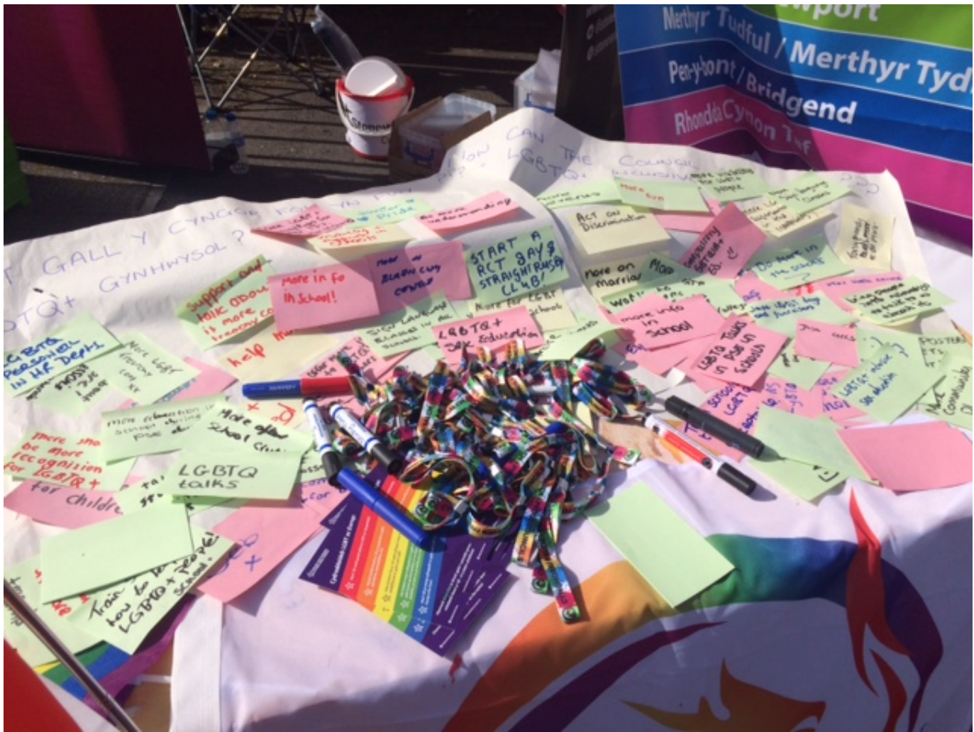
Community engagement at Rhondda Pride in Treorchy.