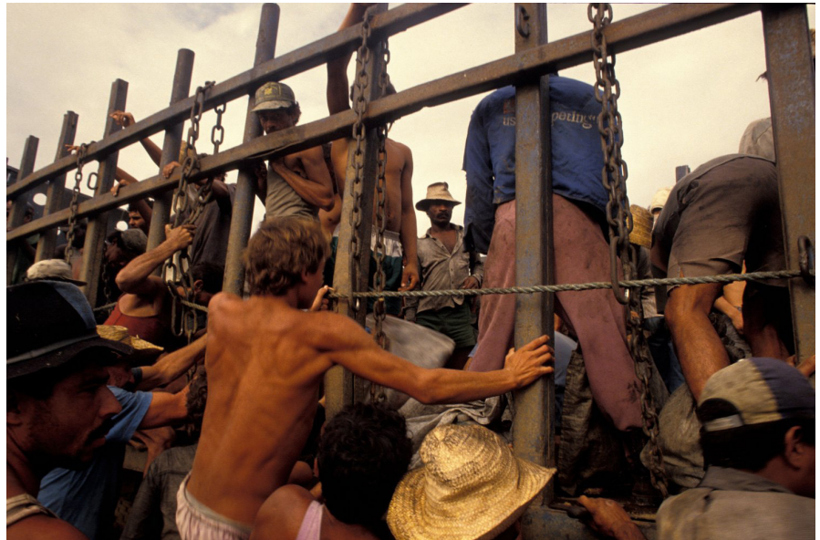
Not all companies are compliant with its provisions in the Modern Slavery act

In the wake of the Christchurch mosque shooting, LAPFF has been working with New Zealand Super Fund and other