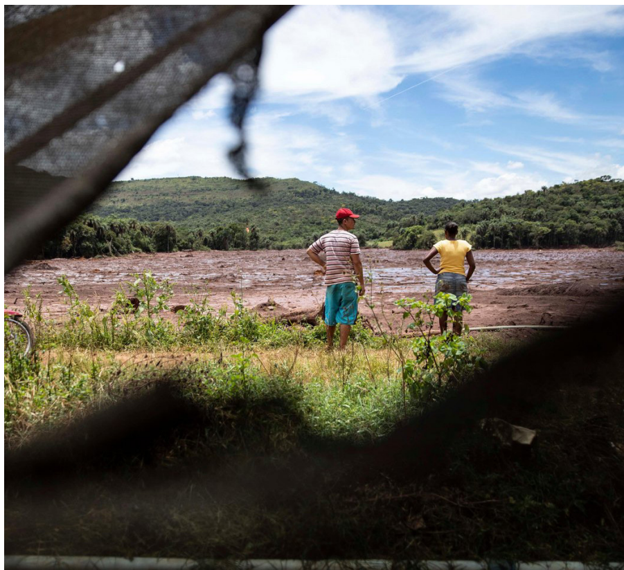
Brumadinho, the area affected by the collapse of a tailings dam in the state of Minas Gerais, Brazil,

2050, demonstrating significant progress. The resolution has been coordinated by ShareAction and co-filed by at least four LAPFF members as well as other institutional investors such as Sarasin. It remains to be seen whether the Barclays resolution will be filed in some form, but the Forum was reasonably happy with Barclay's engagement on this issue.