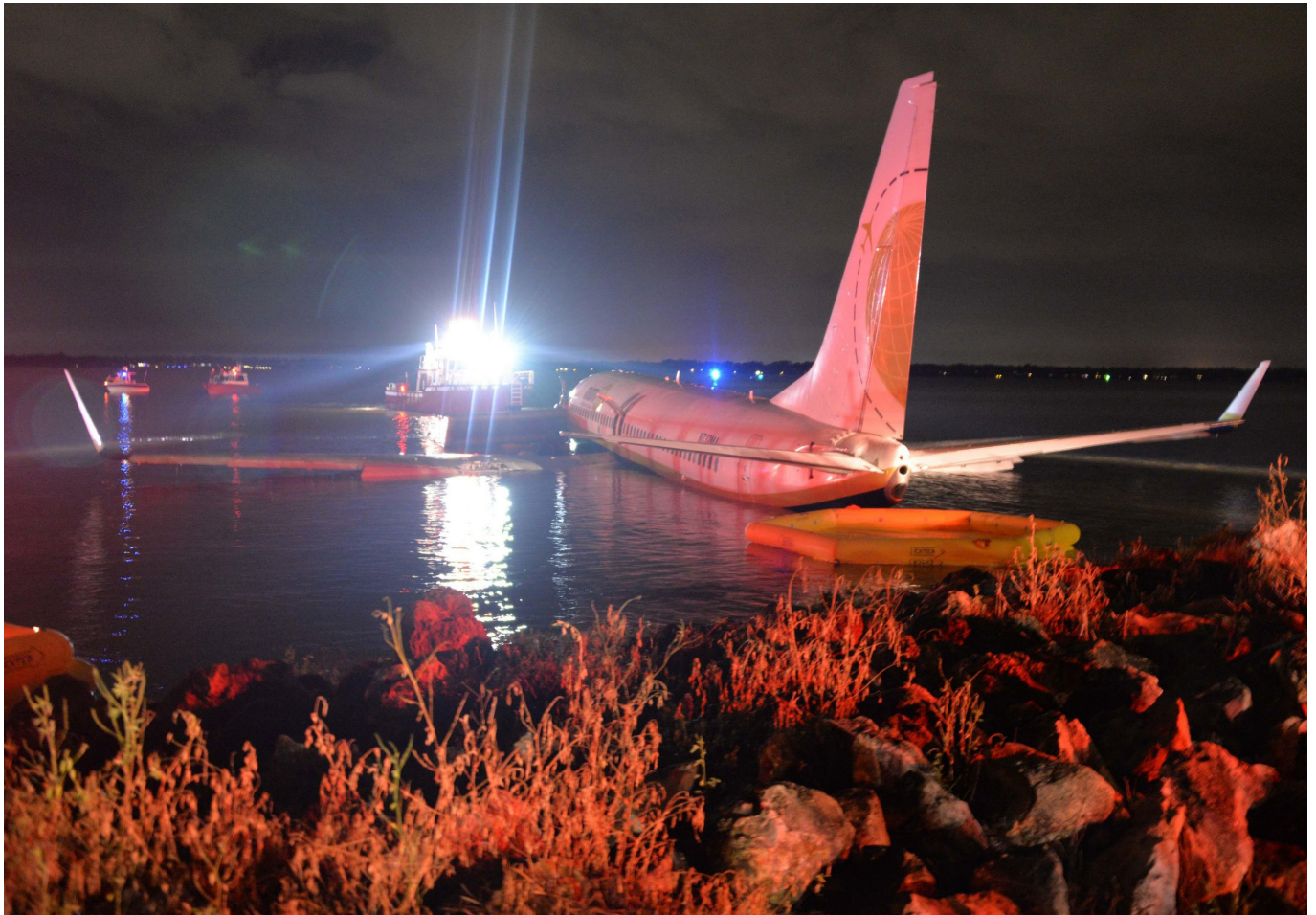
A Boeing 737 aircraft rests in shallow water in the St. Johns River after sliding off the runway at Naval Air Station Jacksonville May 3, 2019 in Jacksonville, Florida