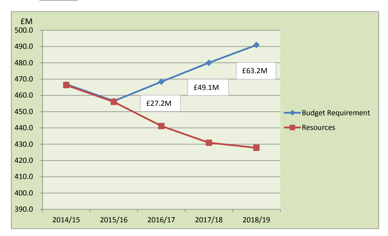
Figure 1: Medium Term Financial Planning Modelling Update (2016/17 to 2018/19)