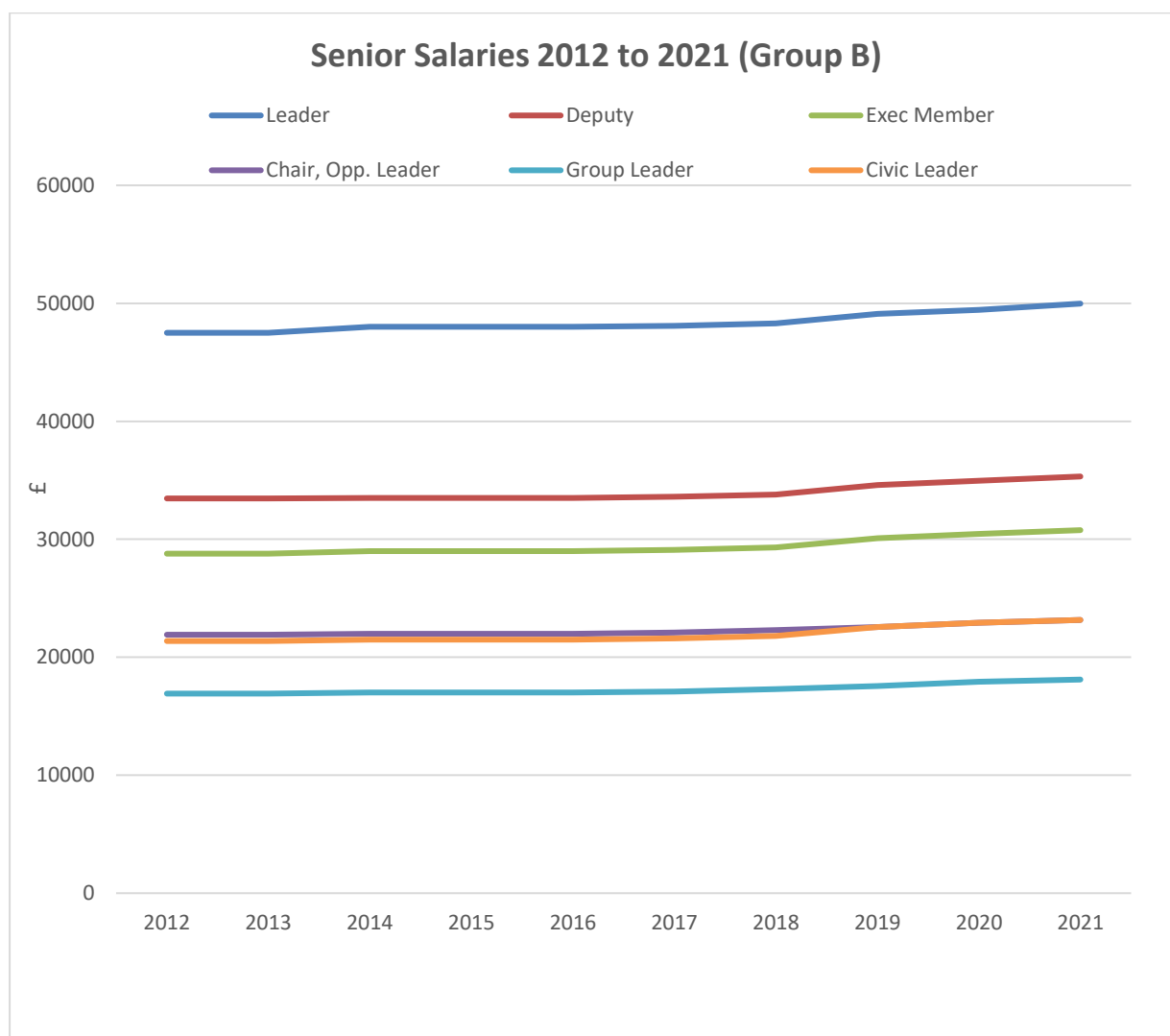
Graph 2: Senior salaries 2012 to 2021