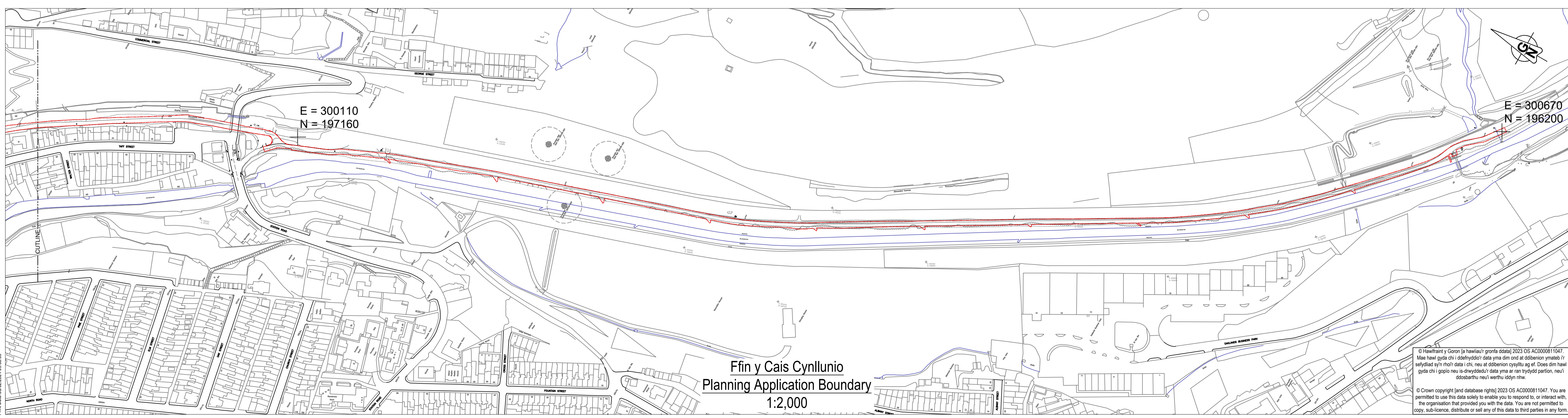
Ffin y Cais Cynllunio Planning Application Boundary 1:2,000