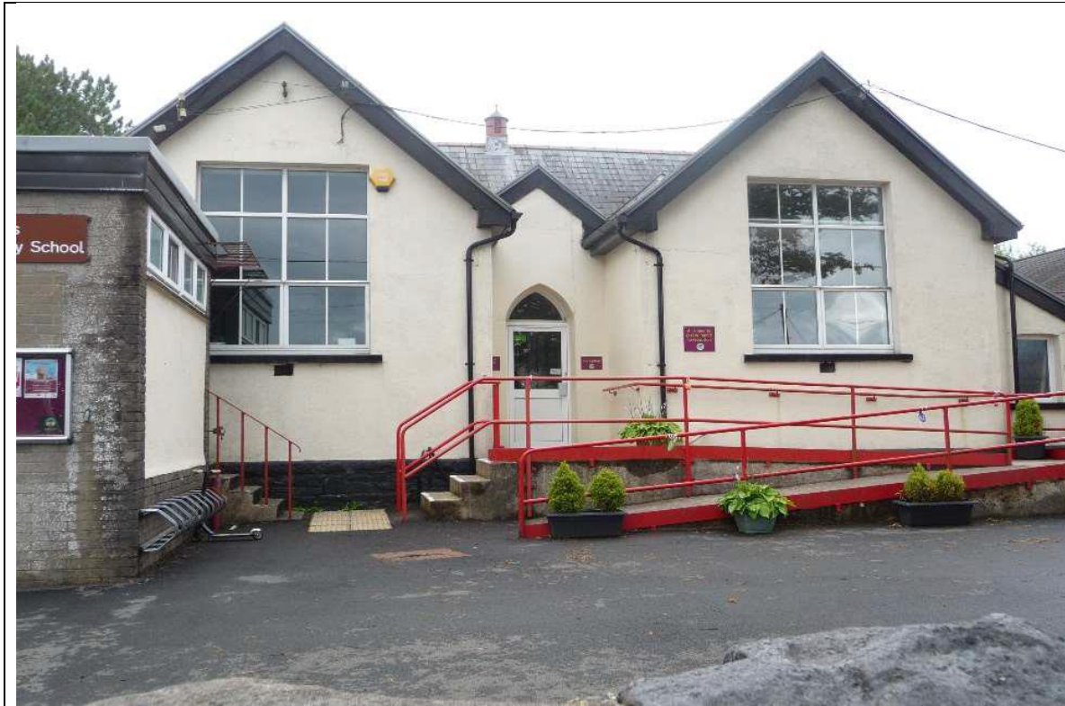
External view of Rhigos Primary School.