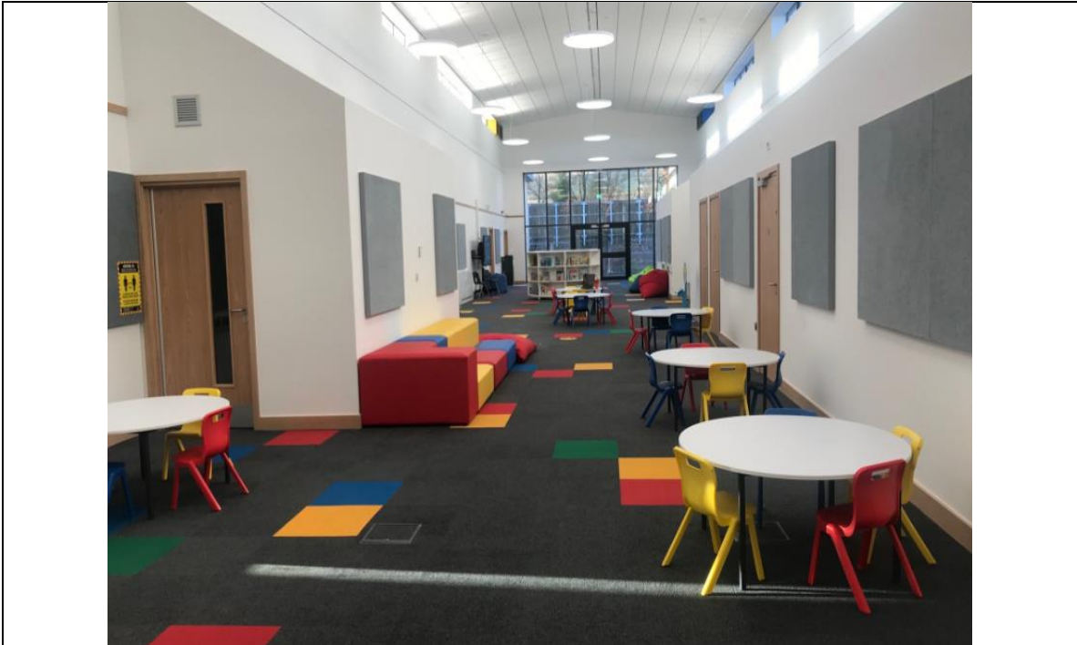
A multi-purpose learning resource area or 'heart space' at Hirwaun Primary School.