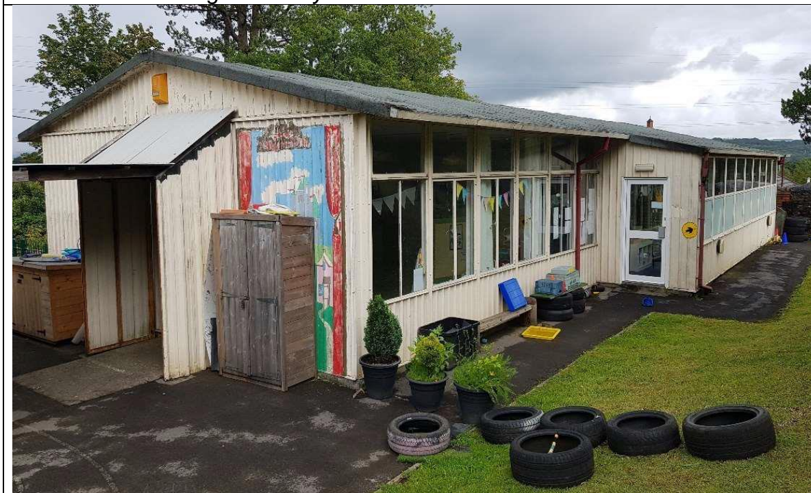
External view of the metal prefabricated building