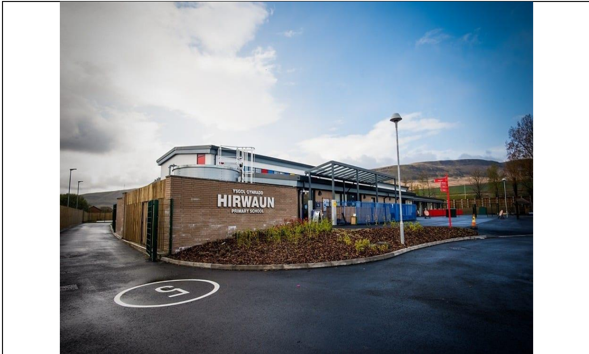
External view of Hirwaun Primary School.

up area for home to school transport, which currently caters for the pupils attending from Penderyn.