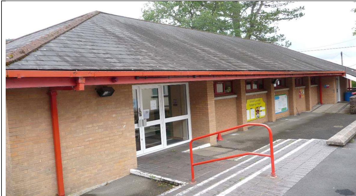
External view of the hall and canteen building

The table that follows outlines the pupil numbers at Rhigos Primary School over the previous five academic years. They were obtained from the statutory Pupil Level Annual School Census (PLASC) which must be undertaken in January each year. The number of nursery age pupils for each academic year is shown separately, as required by the Welsh Government's School Organisation Code 2018 (011/2018).