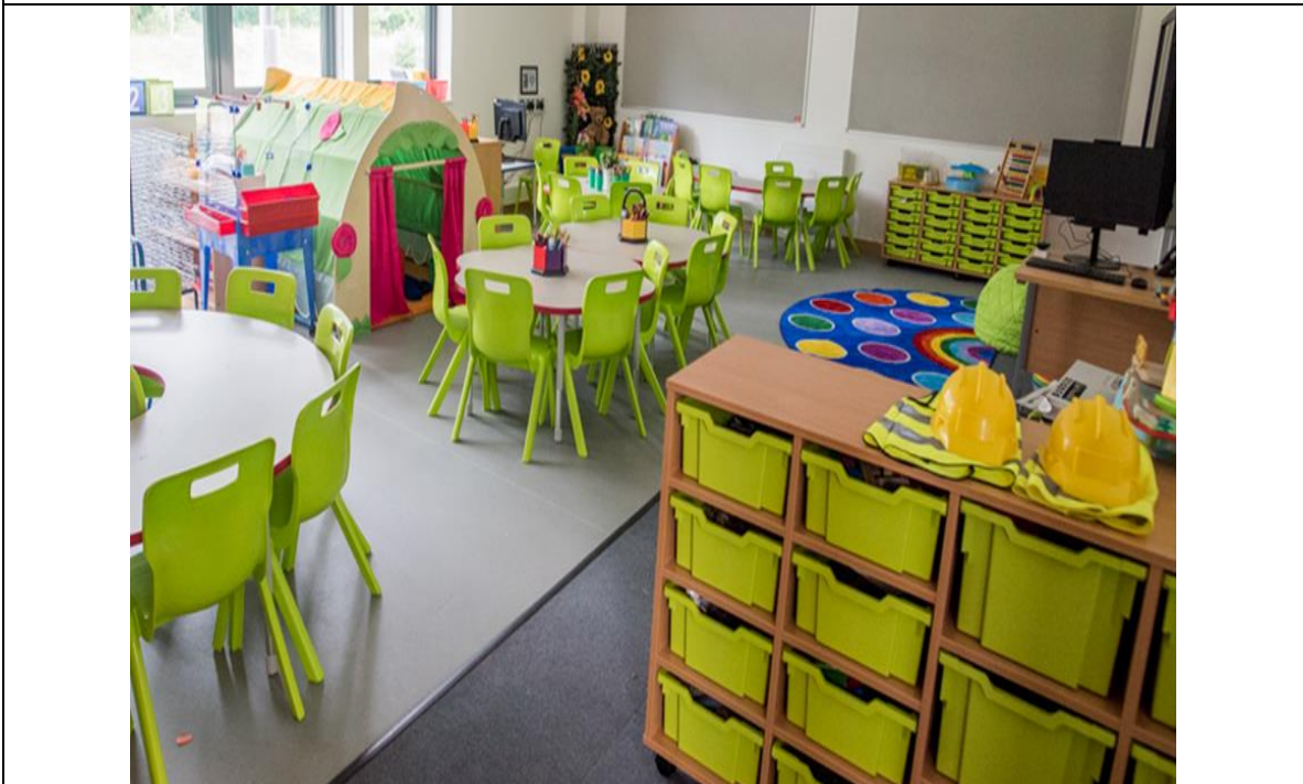
Foundation phase classroom in Hirwaun Primary School.