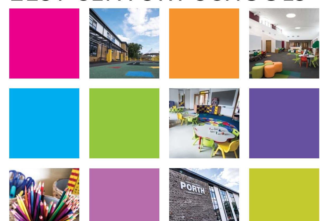
CONSULTATION ON A PROPOSAL TO CARRY OUT A REGULATED ALTERATION AND TRANSFER YSGOL GYNRADD GYMRAEG LLYN Y FORWYN TO A NEW BUILDING ON A NEW SITE

This consultation document and appendices are also available on the 'Get Involved' page on the Council website