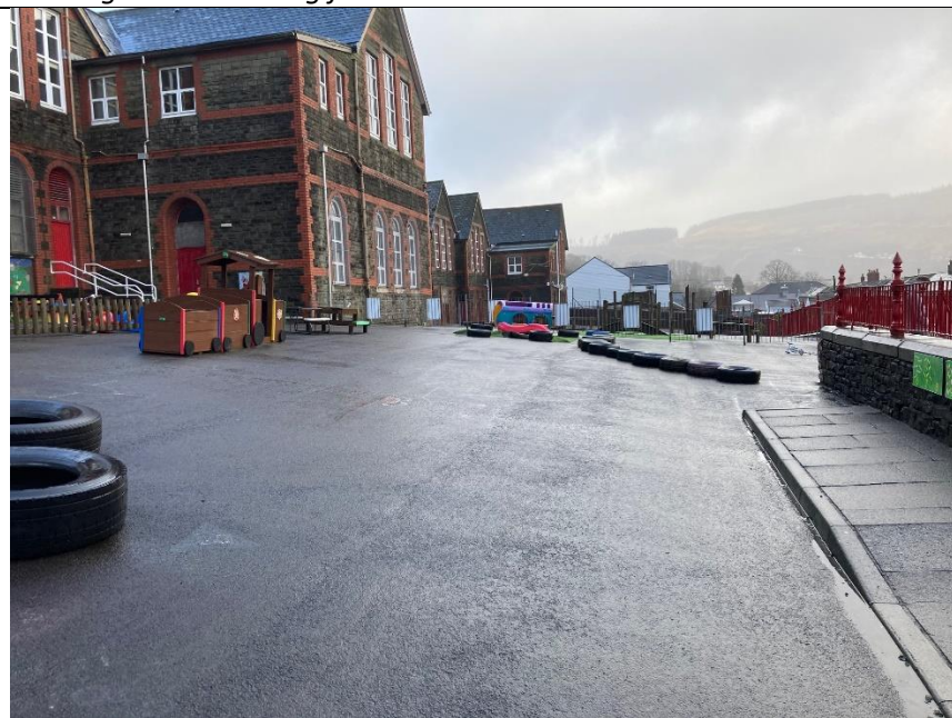
The view of the tarmac yard servicing the infant block.