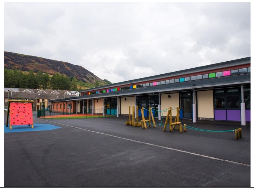
External view of Cwmaman Primary School opened by The Council in 2018.