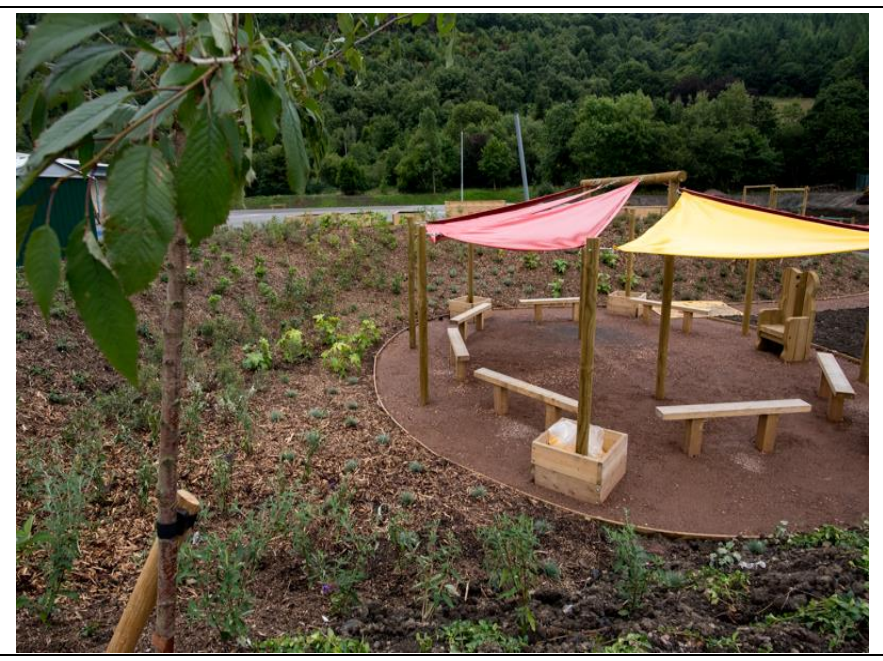
Example of outdoor learning area at Cwmaman Primary School.

There will be on-site provision for staff parking as well as an on-site dedicated drop-off area for the home to school transport vehicles.