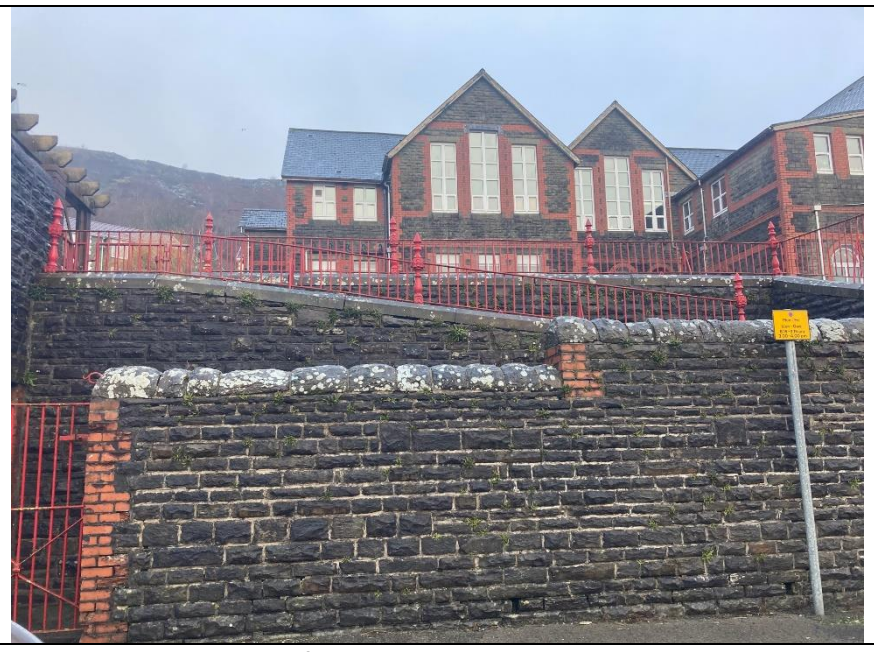
The view of the existing school building from Darran Terrace.

YGG Llyn y Forwyn is a Welsh medium community school located at Darran Terrace, Ferndale. The school site consists of a traditional stone Victorian School building. According to the condition survey of the school carried out by the Council in 2019, YGG Llyn y Forwyn is graded D for condition and C for suitability, where A is the highest and D is the lowest performing building respectively. It is acknowledged that this is the worst school in the Council's education portfolio in terms of condition and suitability.