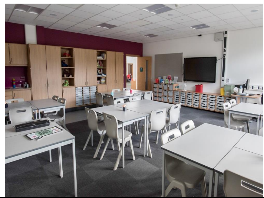
Typical junior classroom in a 21st Century School delivered by the Council.