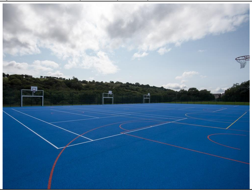
Example of MUGA servicing Tonyrefail Community School.