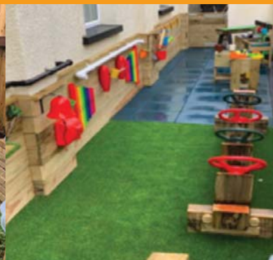
Home From Home Children's Day Nursery, Porth