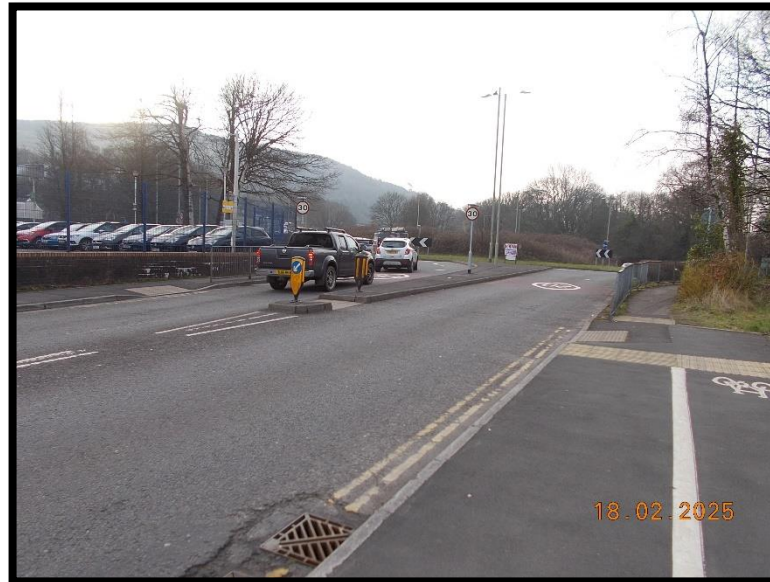
Photograph 4.14 – Signalised crossing across Heol Crochendy to the main college campus building