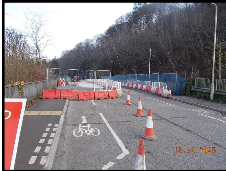
Photograph 4.5 – Signalised crossing (under construction during the time of the assessment) at the junction with Cemetery Road and the A4054 Cardiff Road