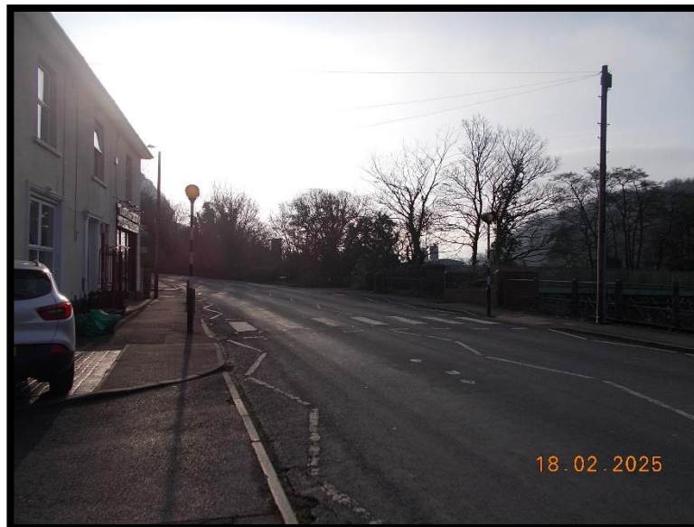
Photograph 4.7 – Zebra crossing outside the Co-op on the A4054 Cardiff Road