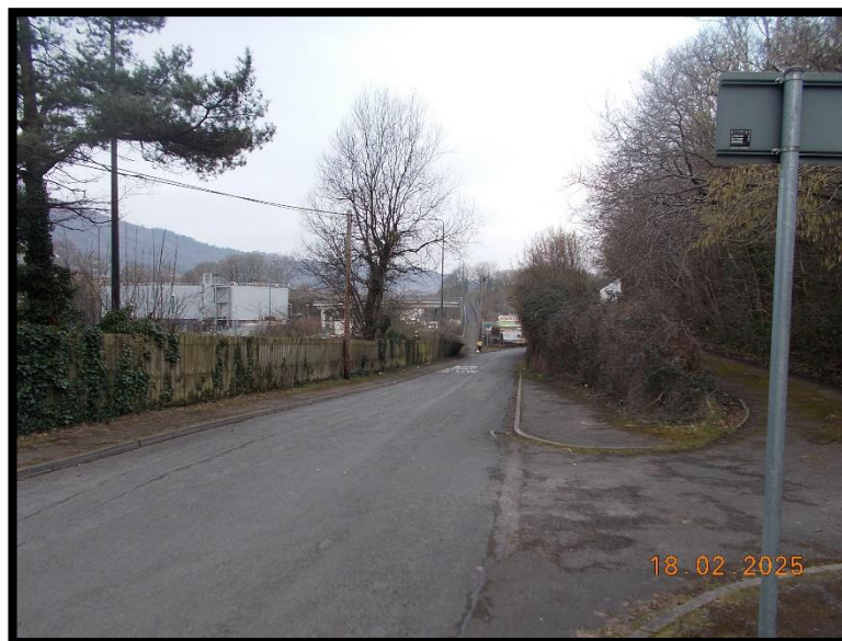
Photograph 4.15 – Footway on NCN8 along Forest Road