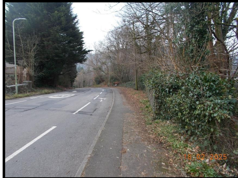
Photograph 4.3 – Wide crossing (with Active Travel priority for cycling) of the junction of Cemetery Road with the lightly used Forest Road