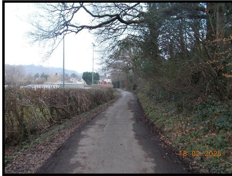
Photograph 4.19 – Footway link on Moy Road to join the Main Route at the A4054 Cardiff Road