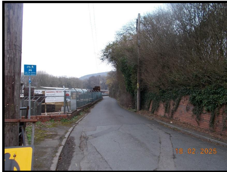
Photograph 4.17 – Virtually traffic free shared use space (walking, cycling and motor vehicles) along NCN8