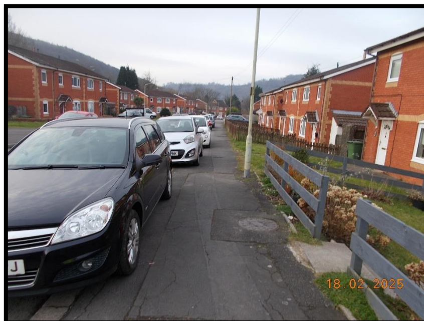
Photograph 4.1 – Start of the route at Ty Rhiw with vehicles parked on footways reducing its usable width

4.2.5 Photographs 4.1 to 4.14 were taken along the walking route and are shown below.