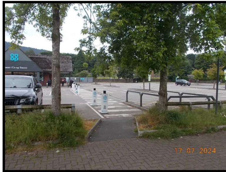
Photograph 6.1 – The CO-OP site carpark congregation point