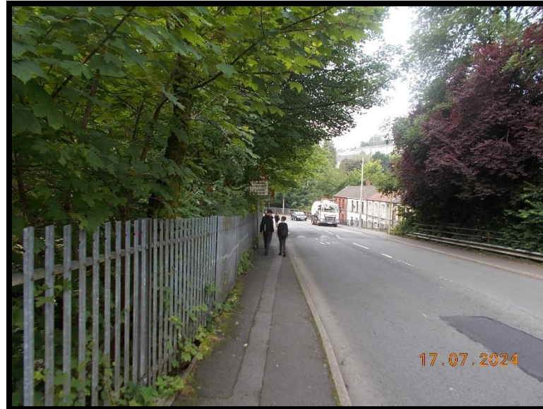
Photograph 4.17 – A4061 Raised zebra crossing link to Treorchy Comprehensive School with overhanging trees on the approach