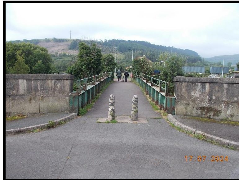
Photograph 4.13 – Active Travel Footway link adjacent to the Oval Rugby Field