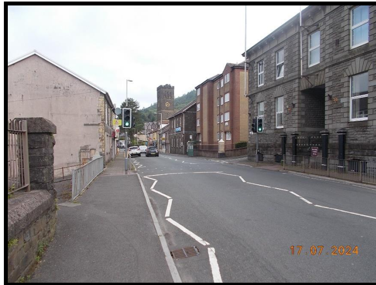
Photograph 4.8 – Signal controlled crossing outside Moriah Capel Y Bedyddwyr on A4058