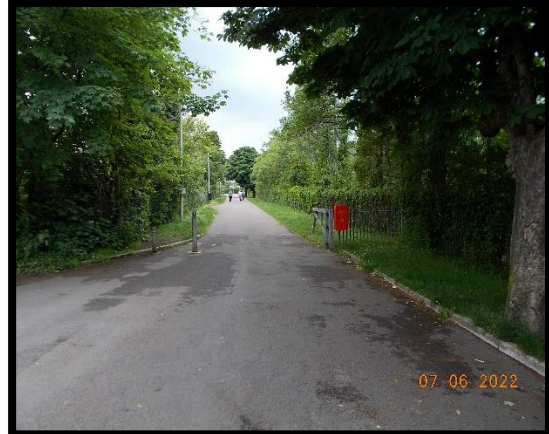
Photograph 4.11 – Alternative route via Rees Street 'cut through' to the Treorchy Oval car park from A4058