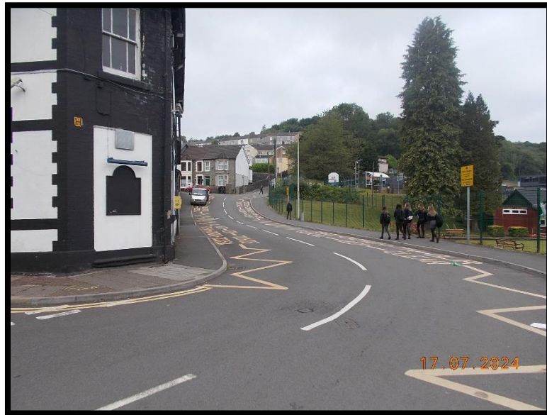
Photograph 4.19 – Treorchy Comprehensive School main gate on Conway Road, Cwmparc