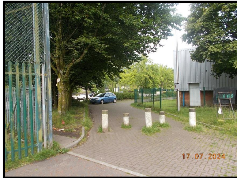
Photograph 4.15 – Alternative walking route through the Co-op carpark