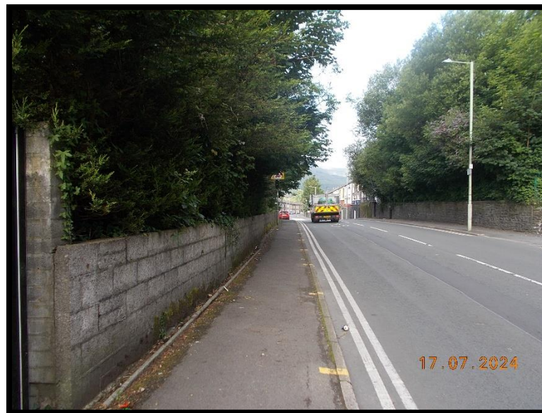
Photograph 4.4 – On-street parking issues outside the old Railway Inn on A4058 Ystrad Road