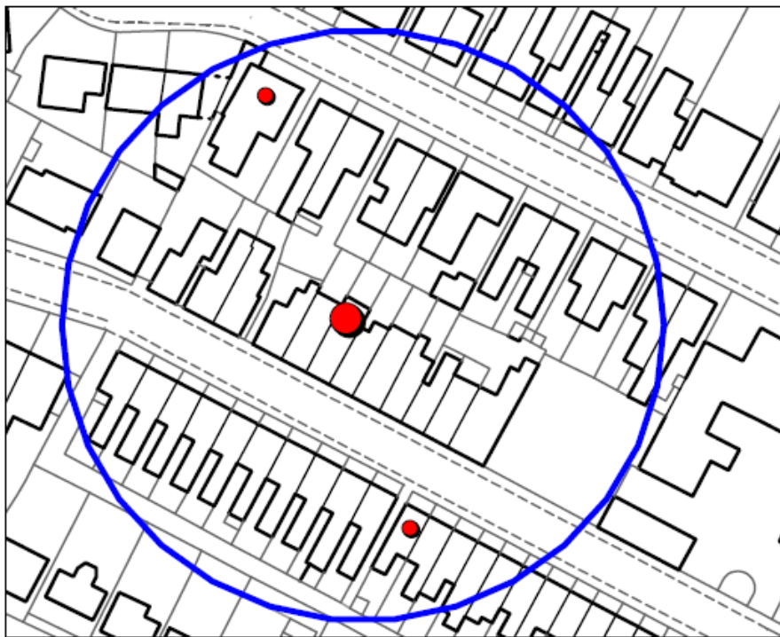
Figure 4 - Example of a suitable HMO application in the 10% Threshold Area;

4.6. Figure 4 the same application site as previous, although in this scenario, there are just 2 HMO of the 50 residential dwellings in the radius area. This would equate to just 4% of all the properties. This would therefore be acceptable in principle in all parts of Rhondda Cynon Taf.