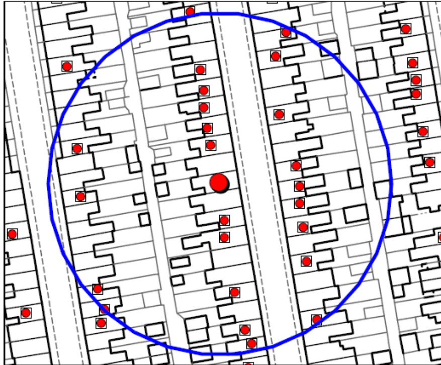
Figure 1 – Example of unsuitable HMO application in 20% Threshold Area;