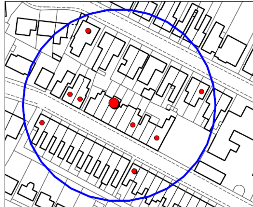
Figure 3 - Example of suitable HMO application in the 20% Threshold Area, but unsuitable in 10% Threshold Area;

4.5. Figure 3 above shows an application site for an HMO, again with 50 dwellings within the 50 metres radius buffer of it. In this instance, there are 8 HMOs within the radius area, or 16% of the properties. Accordingly, an application with this scenario would be acceptable in Treforest in principle, although not acceptable elsewhere in Rhondda Cynon Taf.