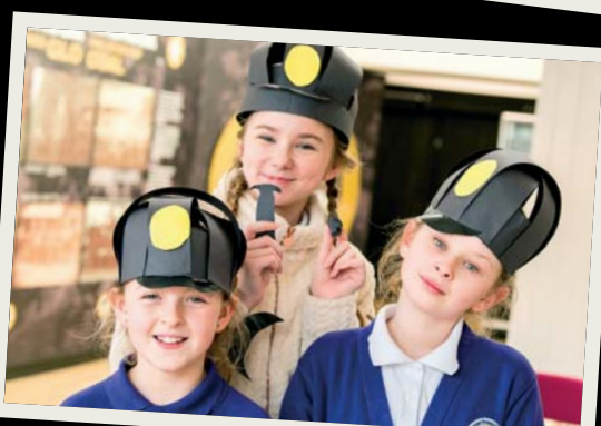
Gwneud Helmed Glöwr Make A Miner's Helmet

Cofiwch fynd â nhw adref gyda chi! Don't forget to take yours home with you!