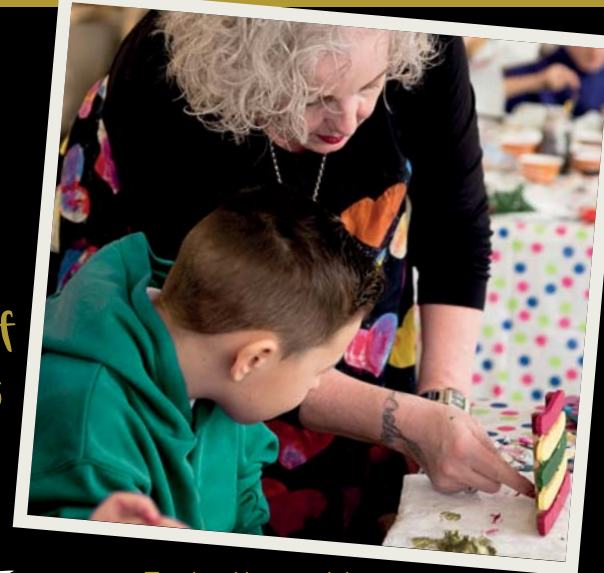
Craft of Hearts

Ewch ati i greu eich campwaith eich hun Make your own masterpiece to take home