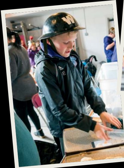
Bocsys Gwrthrychau Artefact Boxes