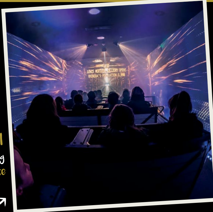
DRAM y Profiad Sinematig The Cinematic Experience

Ewch ar daith ar y dram olaf wrth iddi ymlwybro tua'r wyneb... DALIWCH YN DYNNI! Take a ride on the last dram of coal up to the mine surface... HOLD ON TIGHT!