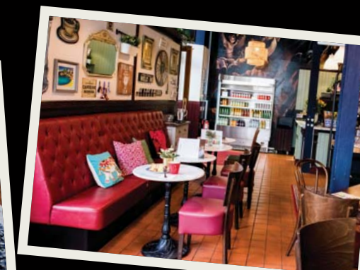
Ac ymlacio! And relax!