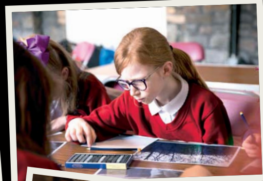
Portreadau a Thirweddau Cwm Rhondda Rhondda Portraits & Landscapes

Celf wedi'i ysbrydoli gan ein tirwedd Art inspired by our landscape