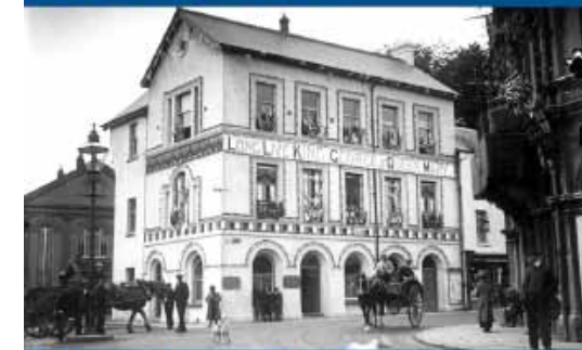
RHONDDA CYNON TAF